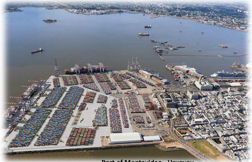
Port of Montevideo - Uruguay

The main destinations for Uruguay's wool exports were as follows: China accounted for 30%, Italy for 16%, Germany for 14%, Turkey for 8%, and Bulgaria for 5%. The remaining 27% distributed among of 28 countries.